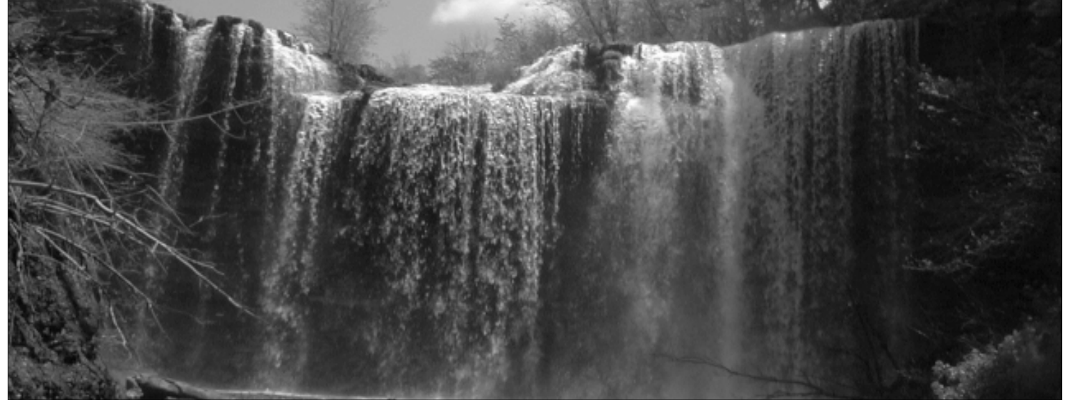
-Wheeler Gully, Protected 2002

"To protect the habitat, open space & farmland of the Genesee Valley Region"